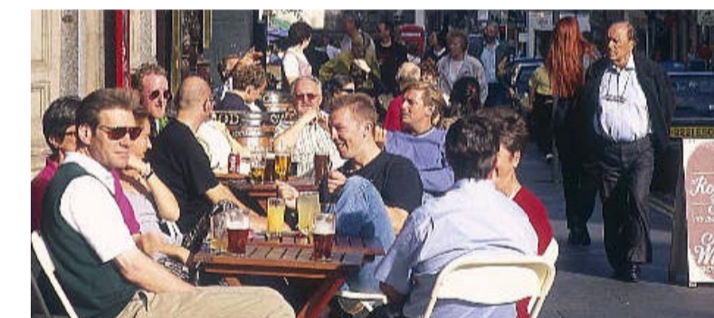
Outdoor cafe culture