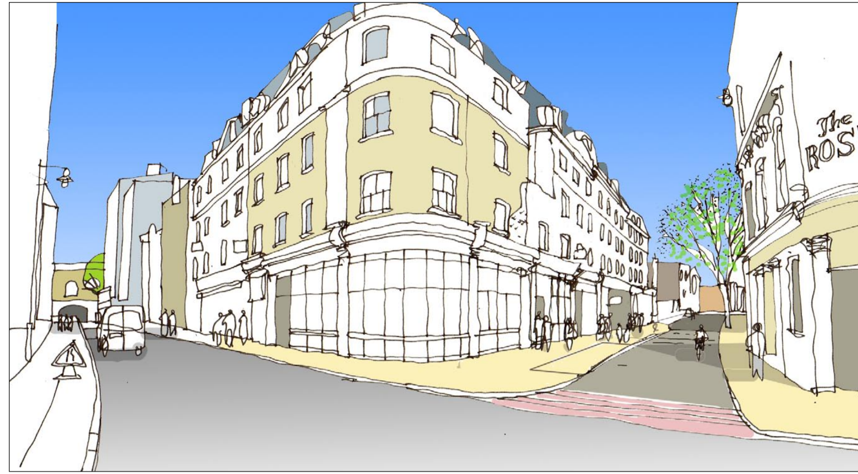
View of Snowsfield from Weston Street

The widening of pavement to the frontage of Snowsfield cluster of cafes and shops provides an inviting pedestrian walkway, that allows for ease of movement for passing pedestrians as well as outdoor café dining. A loading bay for the local business, acknowledged through a designated loading bay zone within the pavement area will not restrict the movement of pedestrians yet allow for loading within designated hours without blocking the narrowed, one vehicle width road. The introduction of new signage, pavement bollards and cycle racks will improve legibility, restrict pavement parking and provide for Bicycle parking in an overlooked, inviting area.